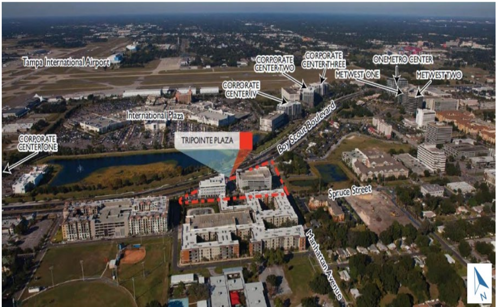
Westshore Retail Overview

GLA: 77,676 SF 15,123 SF Available For Lease