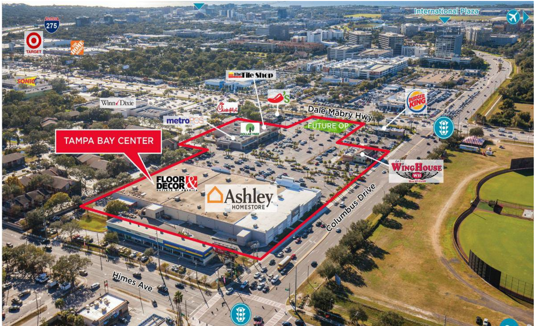
Westshore Retail Overview