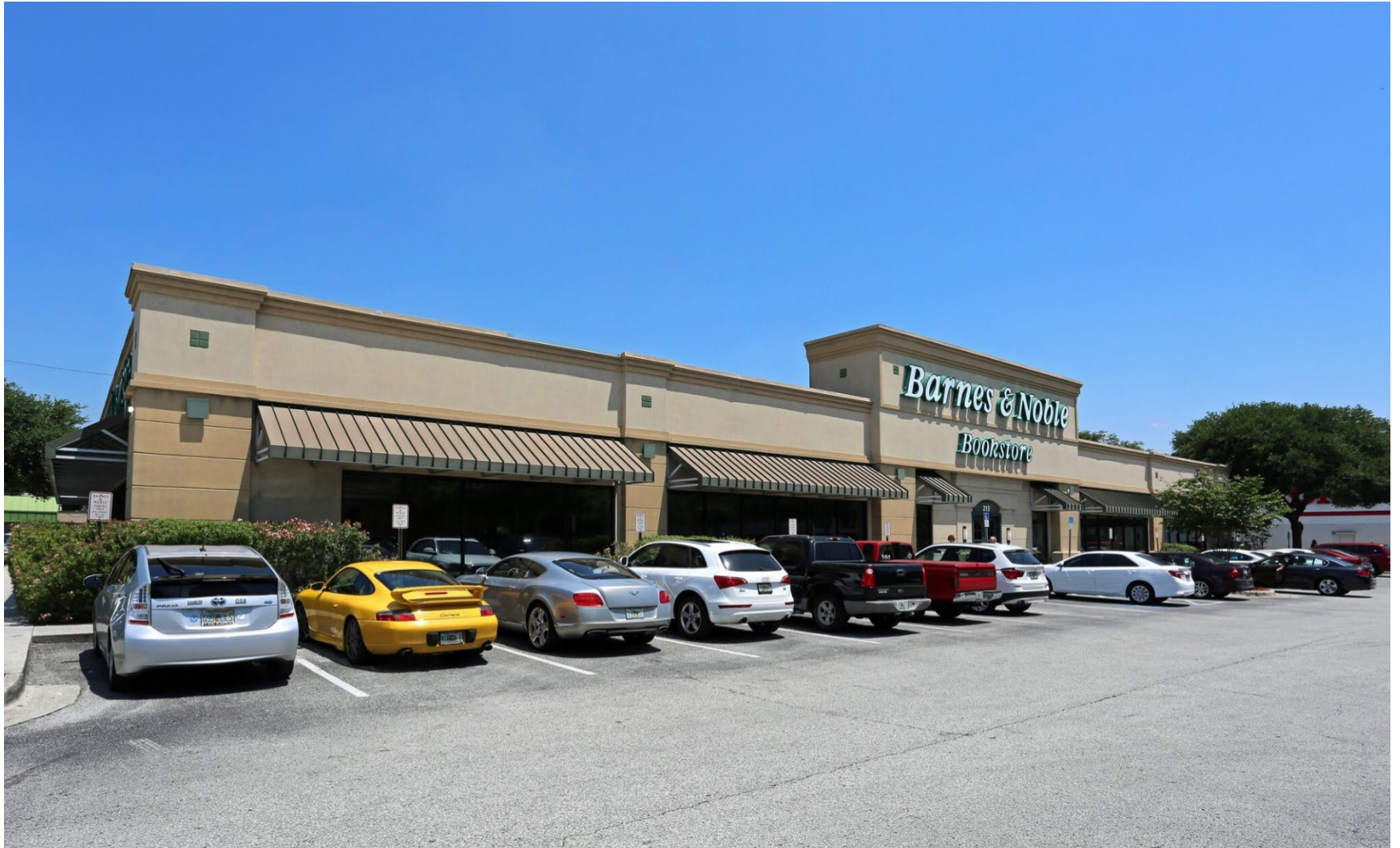
Westshore Retail Overview

Former 20,000 SF Barnes & Noble now located at 128 S West Shore Blvd. 10,244 SF