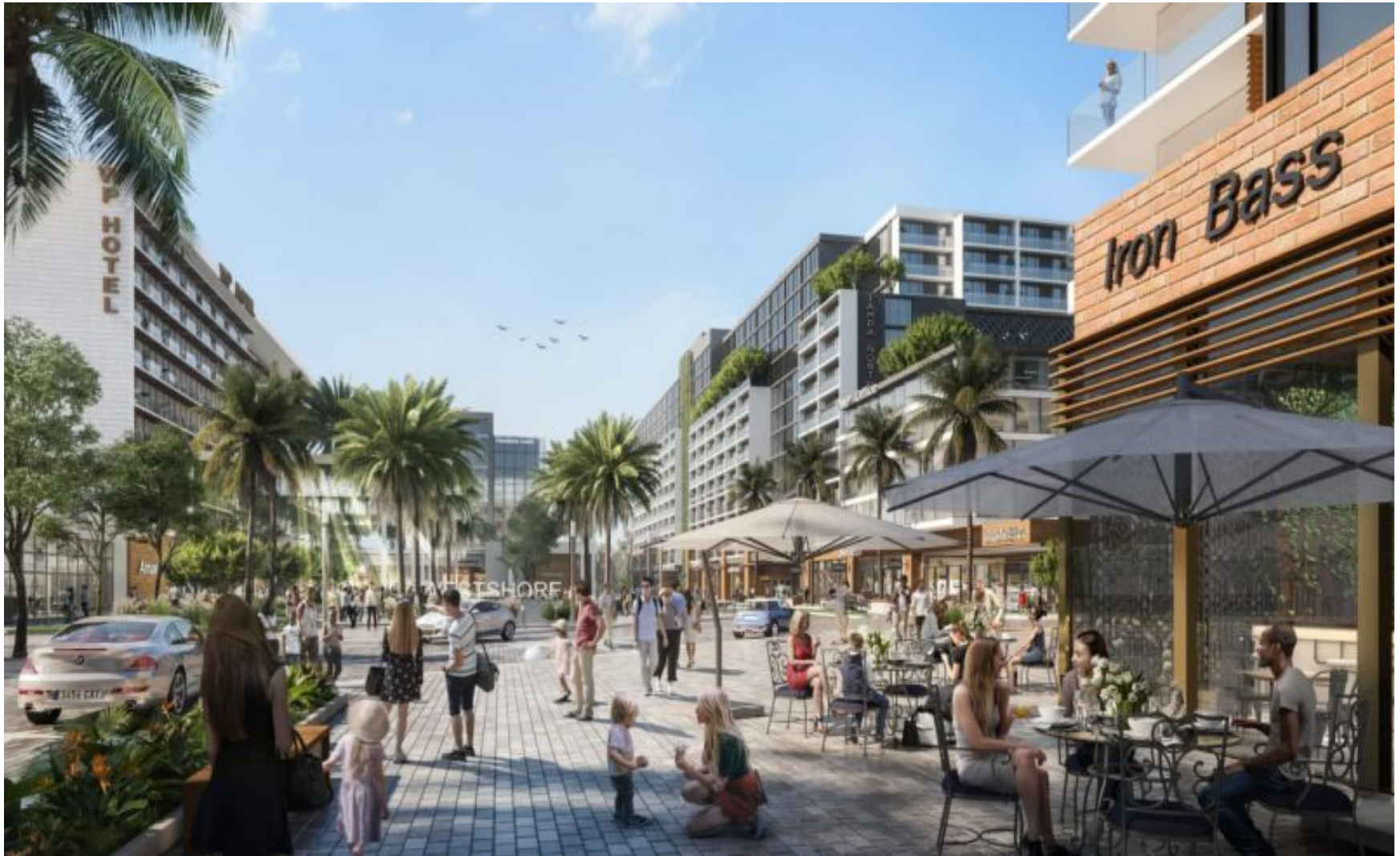
Westshore Retail Overview

Medical: 120,000 SF Hotel: 256,000 SF Recreation: 77,357 SF