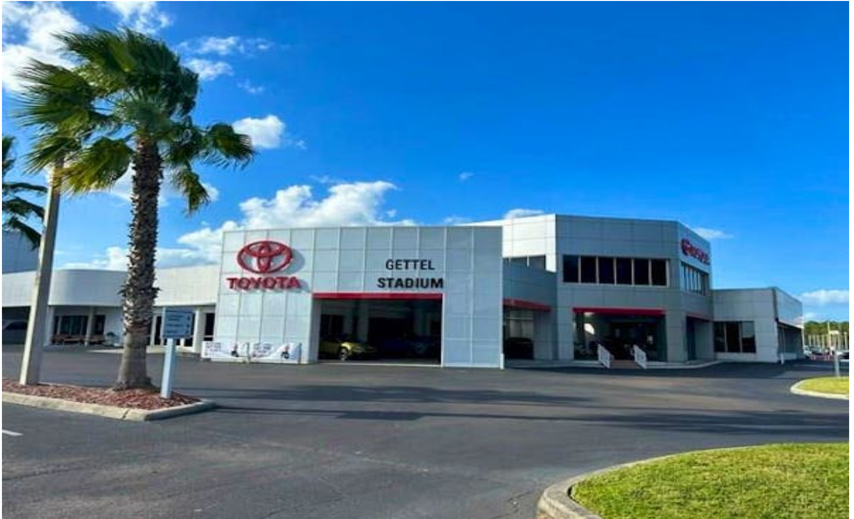
Westshore Retail Overview

60,000 SF 10.26 Acres $19.3 M ($322 PSF) SOLD: 10-23-2023